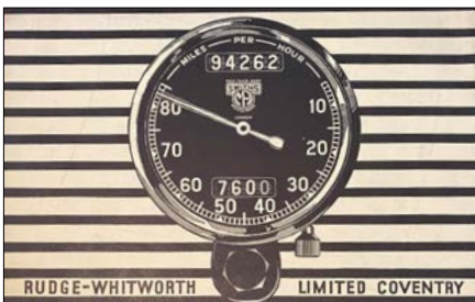
1934 RUDGE-WHITWORTH MOTORCYCLE Sales brochure features 1934 range: 250cc standard & sports model; 500cc Special & Ulster model. Each page has image & specifications. Also six images of special features. Six double-sided pages, cardboard covers, 25mmx18mm. Very good condition. $250 inc p&p. Ph 03 434 0998. MEM NTH OTAGO.