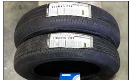
NANKANG ROAD TYRES suit small English car? brand new (surplus to requirements) 2 x 135R15 73T and 2 x 145R15 77T plus 4 new tubes to suit. $75 a pair with tubes. In New Plymouth. Could be couriered. Phone/text 021 113 7054, cmr.mtr91@gmail.com MEM TARANAKI